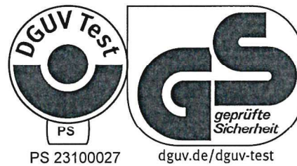
Approved design for a height of 20 mm or less