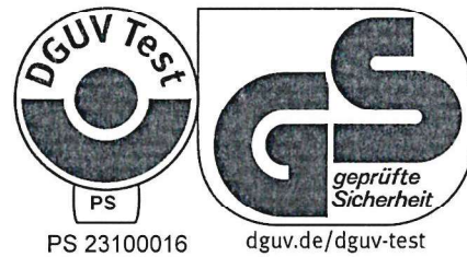
Approved design for a height of 20 mm or less